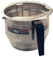
FUNNEL AY,W/DECAL GRT "C"7.62