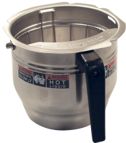
FUNNEL AY,W/DECAL GRT "C"7.12