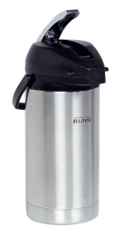
AIRPOT, 3.8L SST LA SINGLE PK