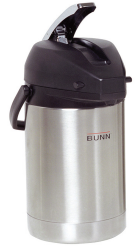
AIRPOT, 2.5L SST LA SINGLE PK